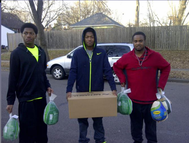
•Delivered turkey baskets for 100 families over North

"Life's most persistent and urgent question is, 'what are you doing for others'" -MLK