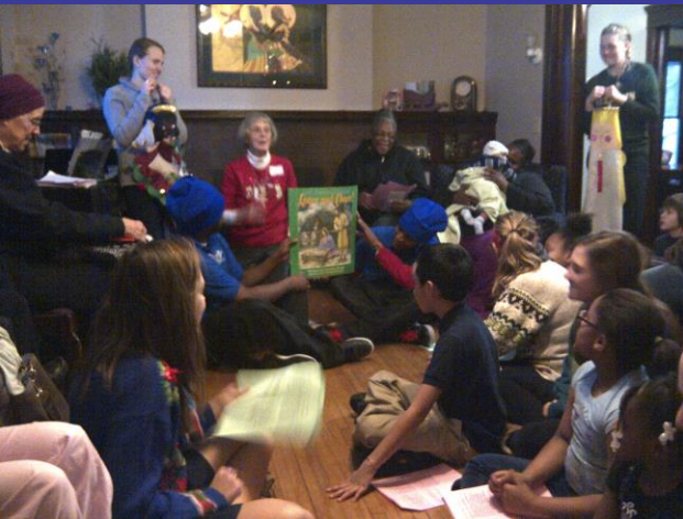
Playing "elves" at Christmas time